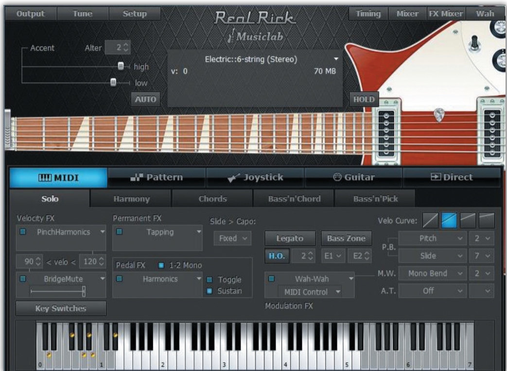
RealRick's GUI, in Solo Mode.

MusicLab's RealGuitar, RealStrat and RealLPC virtual instruments have proved themselves as more than just convenient replacements for a real guitarist when budgets are tight. They reward practice and familiarity, and are capable of highly expressive and detailed performances; dedicated advocates of these instruments have become quite adept at convincing even real plank-slappers that they are listening